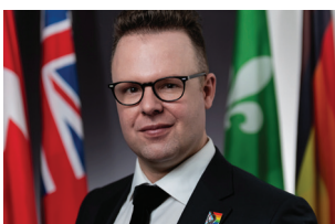
Carl Bouchard French Language Services Commissioner

The French Language Services Commissioner and the French Language Services Unit are part of the Office of the Ontario Ombudsman, an independent and impartial Officer of the Legislature who resolves complaints about government and public sector bodies.