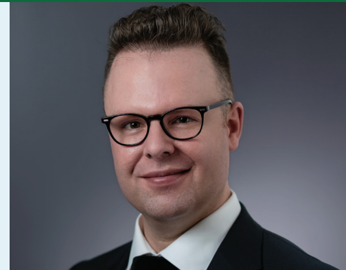
Carl Bouchard Interim French Language Services Commissioner